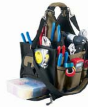
23 Pocket Tool Carrier

Check out their line of gloves, neoprene coated and leather work gloves and tool organizers,